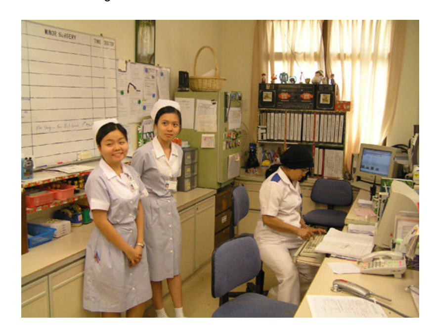
Thursday, March 24, 2005 Closing Thoughts