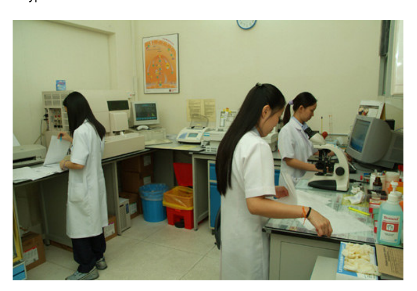
A small nursing office: